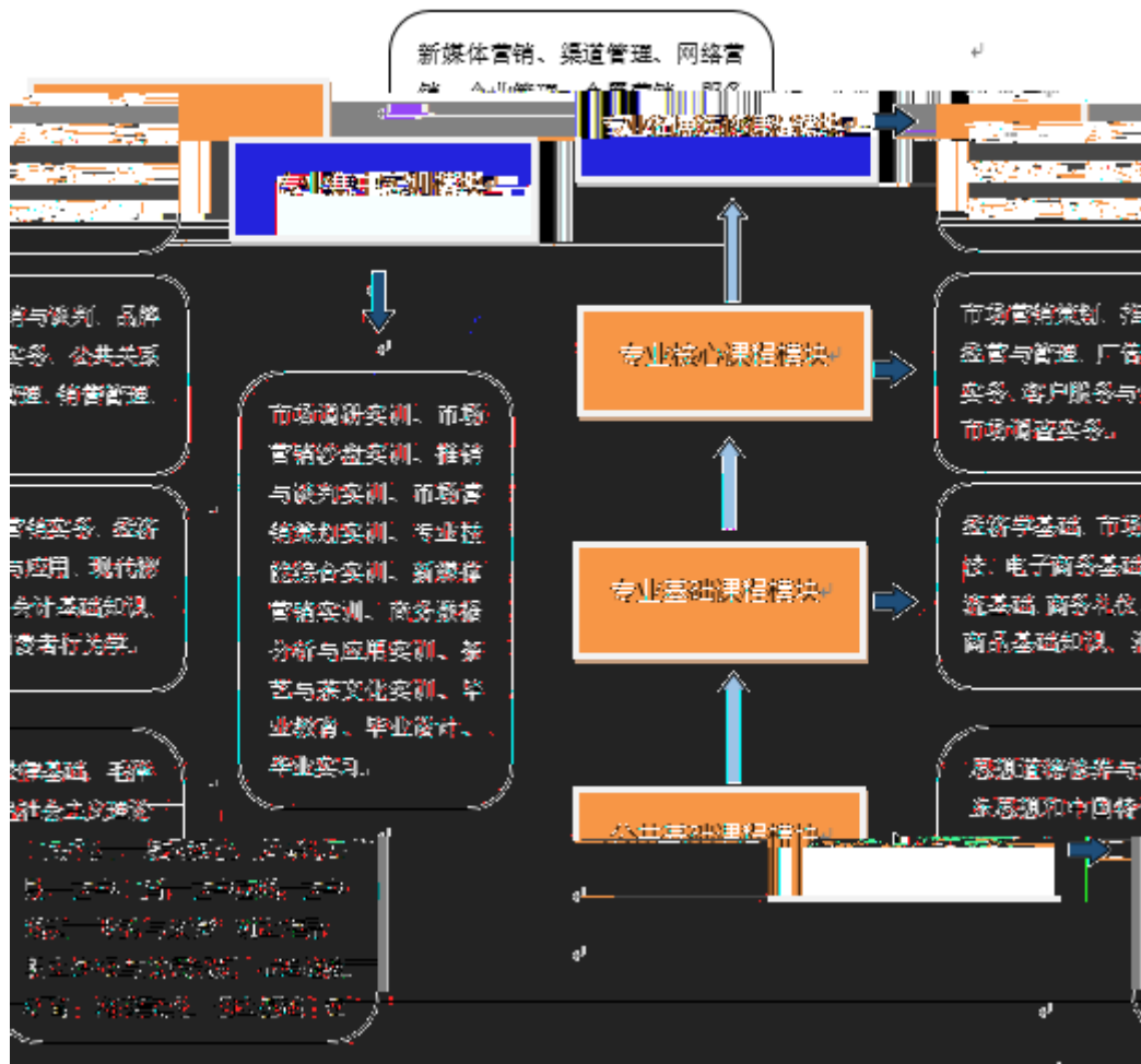
图 1 市场营销专业课程体系图